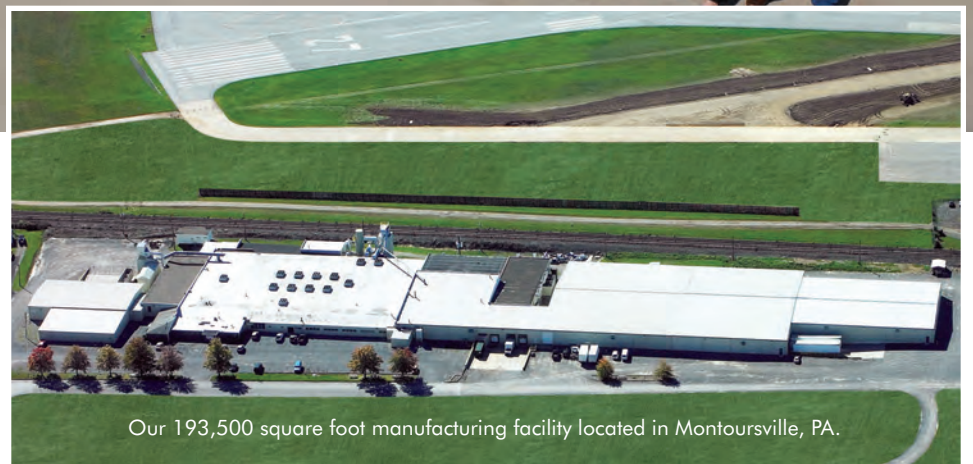
Our 193,500 square foot manufacturing facility located in Montoursville, PA.

Proud of the People of Savoy. Every employee is in charge of quality assurance.